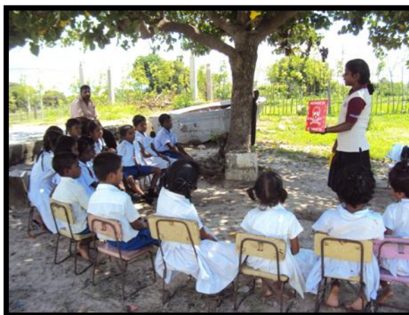
School MRE awareness program.