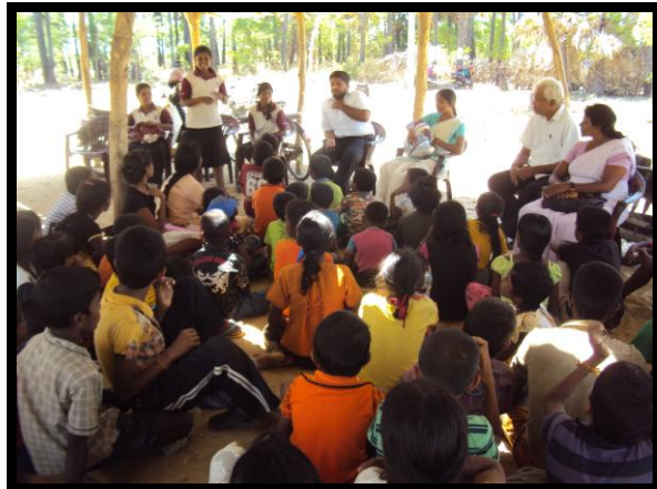
Community MRE awareness program.