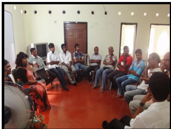
A Discussion on improving short film production.