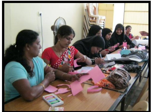
Pre School teachers training.