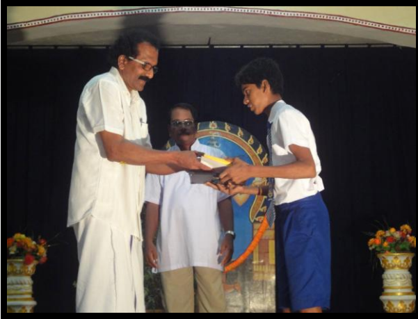
Provincial Education Minister Mr.T.Kurukularajah giving the prize for a student in the Youth Festival.