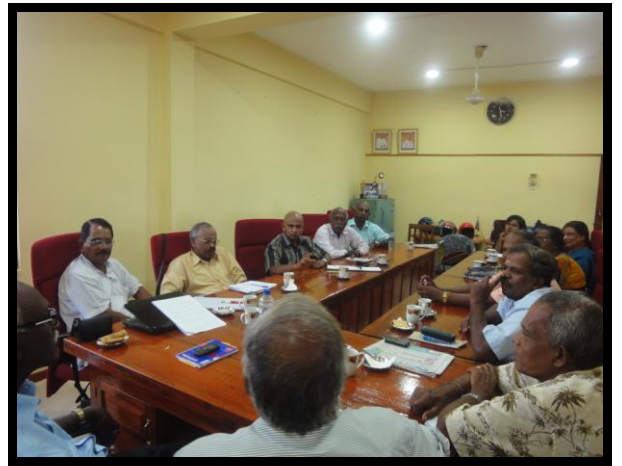
Cooperative research discussion is taking place with the Cooperative Management Board members.