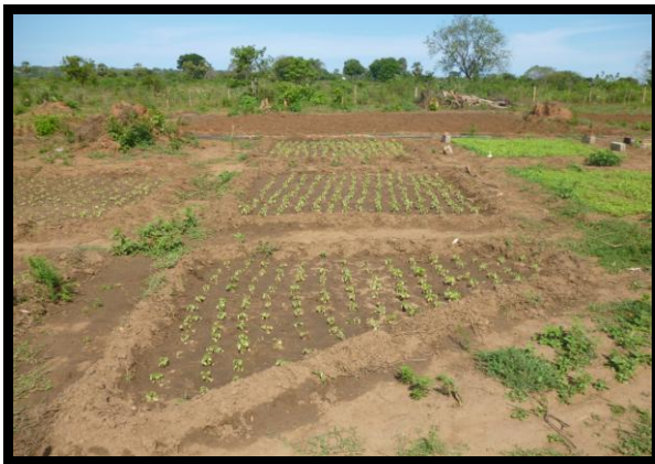
SOND Organic Model Farm in Ampara district.