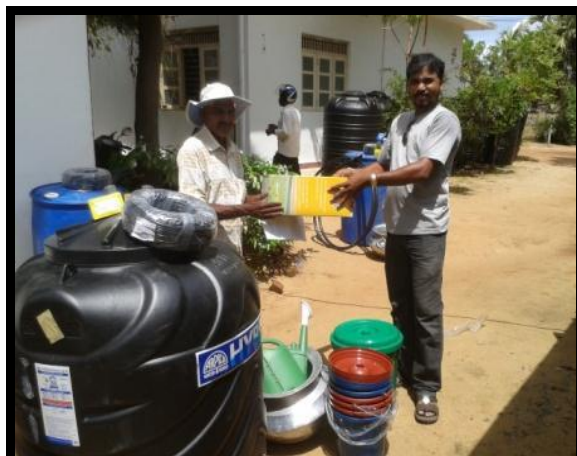
Materials are provided by SOND Batticaloa District Organic farmers.