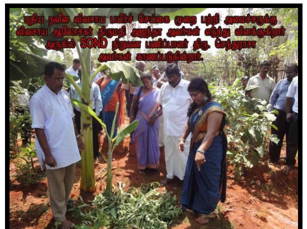
Provincial Agriculture Minister is visiting the Organic farm.