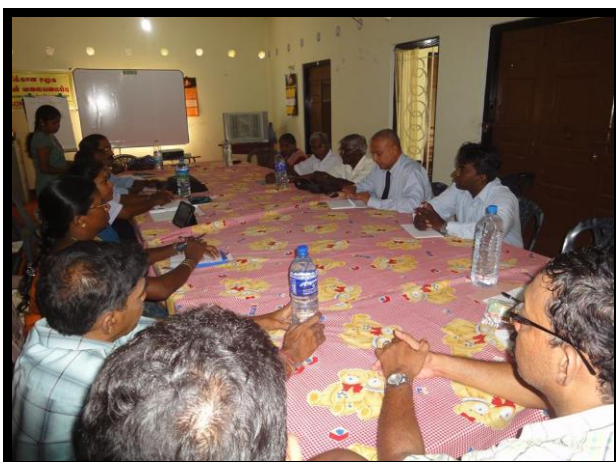
Cargrills Northern Manager is meeting with the local producers in SOND office.