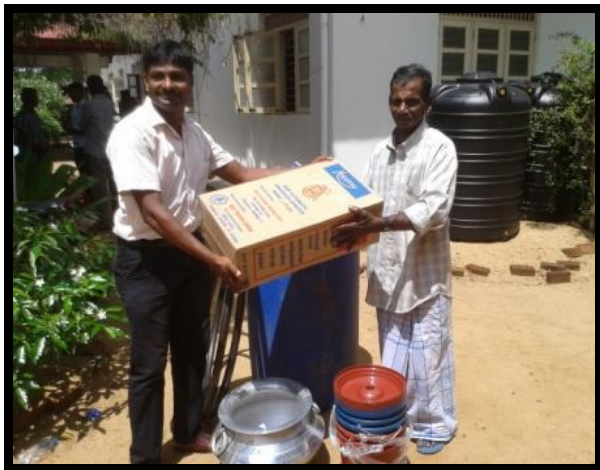
Materials are provided by SOND Batticaloa District Organic farmers.