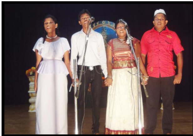
All community Youth are performing a play in the Youth Festival.