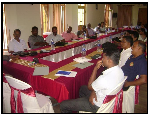
SOND has Organized a meeting with the government departments and INGOs on Climate change issues in Batticaloa.