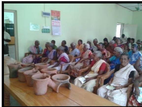
Anaki Cook stove ( Less fuel stove ) is provided for the women in Batticaloa district.