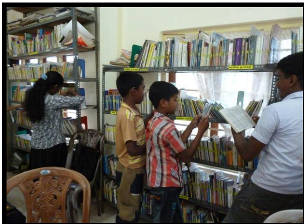
Children are using SOND Library.