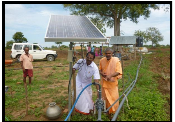
SOND is using solar power to water the farm in Ampara district.