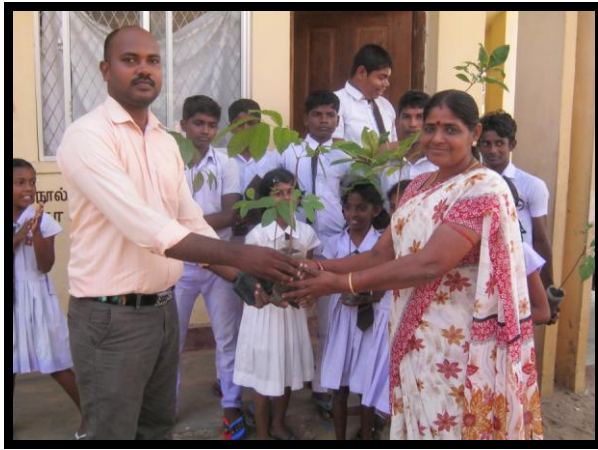
SOND staff is providing plants to the school environment club in Ampara district.