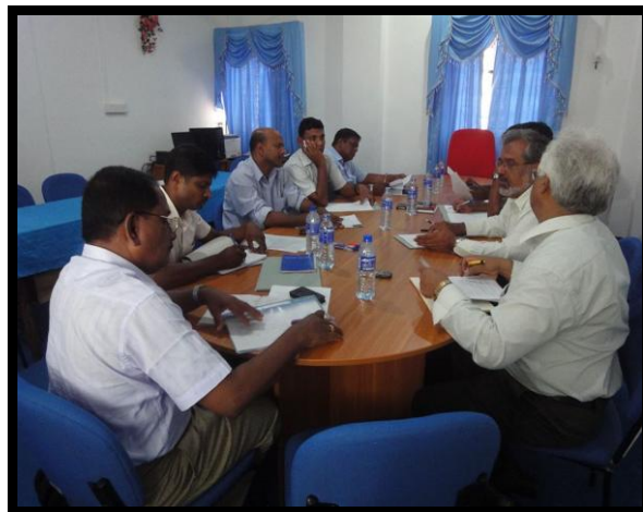
SOND has Organized a discussion in the Eastern University on Climate change strategy.