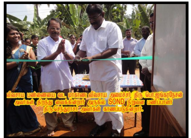
Provincial Minister of Agriculture Mr.P.Inkaranesan is inaugurating the new Organic Farm in Neerveli – Jaffna.