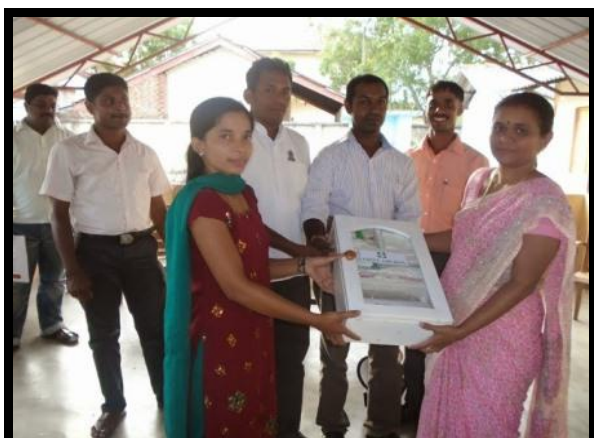
First Aid Box is provided for the Village level Rescue team members in Batticaloa district.