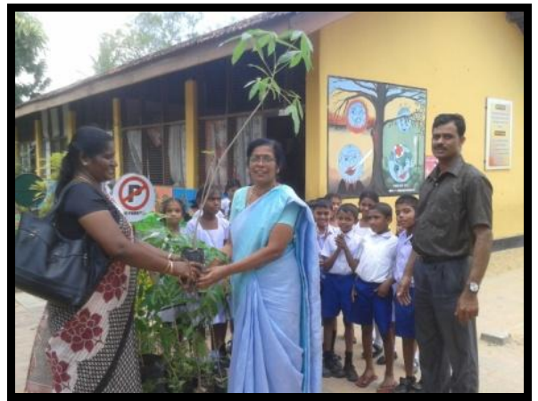
SOND staff is providing plants to the school environment club in Batticaloa district.